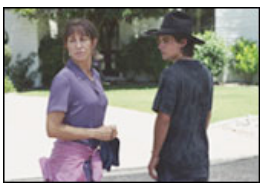
Felicity Huffman has been nommed for actress for her turn as a man about to undergo surgery to become a woman in 'Transamerica.'

As always, nomination announcements are sure to reignite the debate over what defines an indie film in the age of studio specialty arms, especially given the wide budget range between the films vying for an award. "Squid" cost $1.5 million to make, while "Brokeback" cost between $13 million and $15 million.