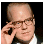
Noms for top films went to 'The Squid and the Whale,' 'Brokeback Mountain,' 'Good Night,' 'Capote' and 'Three Burials.'

Samuel Goldwyn Films' offbeat family drama "The Squid and the Whale" picked up six noms to lead all contenders for the 2006 Independent Spirit Awards.