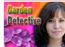
Send us your garden shots