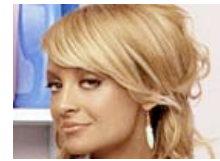
Celebrity blog: Star Struck