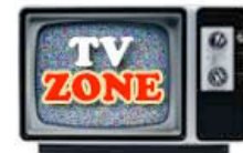
The TV Zone