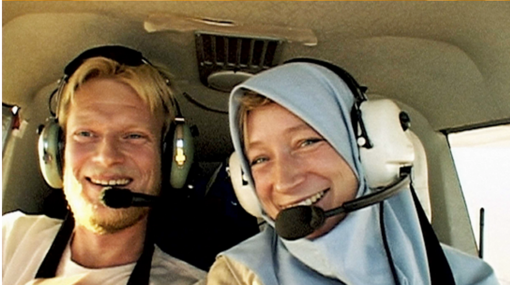
A scene from "Smiling In A Warzone -- And the Art of Flying in Kabul," which will open the 8th Thessaloniki Documentary Festival tonight in Greece.