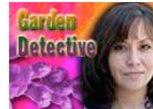
Send us your garden shots