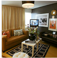
A Decorator Show House for More Than Show

Where the Boys Are, at Least for Now, the Girls Pounce