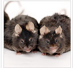
Substance in Red Wine Extends Lifespan in Mice

Green Leadership Is Essential Readers respond to Thomas L. Friedman.